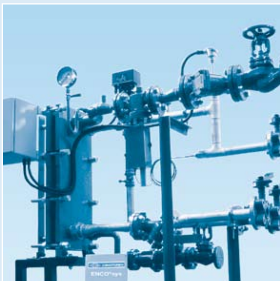
e.g. ENCOsys®... ... for waterhammer-free heat exchange of steam to water through steam of condensate pending control (with ARI-STEVI® or ARI-TEMPROL®).