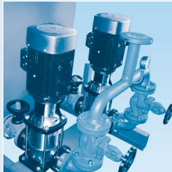
e.g. CORsys®... ... for unrestricted return of the condensate. With digital indication of the condensate temperature on the integrated pump and level control.