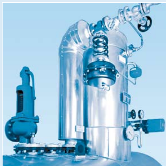
e.g. feedwater tank with deaerator dome... ... for supplying returned condensate and fresh water to the boiler via the deaerator dome and the feed water tank. The exceptionally durable design of the boiler is achieved by removing inert gases from the condensate / fresh water.