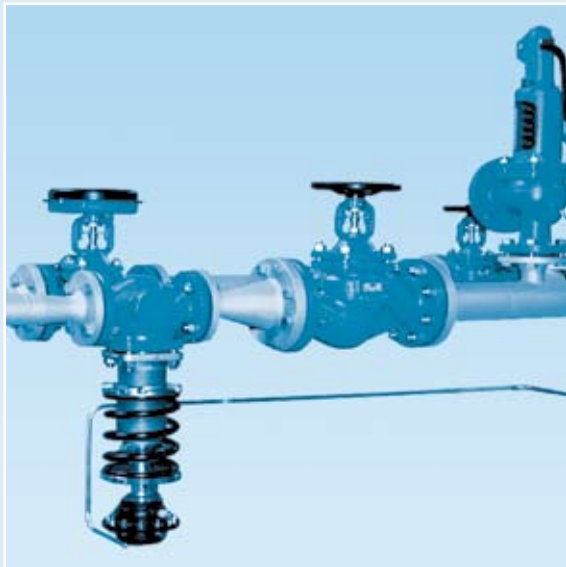
e.g. PREsys®... ... for safe pressure reduction and adjustment (with ARI-PREDU® or ARI-STEVI®). Optional: Bypass with ARI-FABA® and orifice plate.